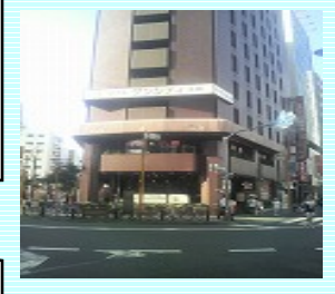
HOTEL Sun City