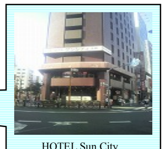
HOTEL Sun City